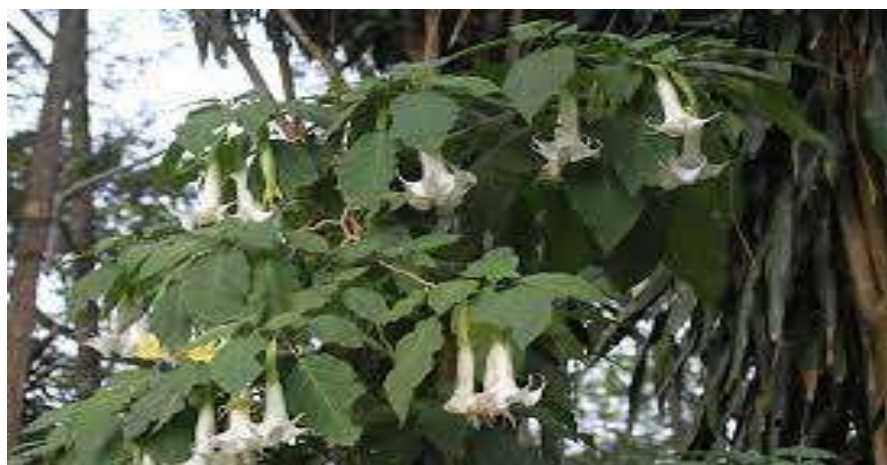
Figure 1: Datura Arborea Linn

considered to form the Datureae Tribe of the family Solanaceae [13]. The plants of this genus are large perennial shrubs or small trees, usually distributed in the world as ornamental plants, especially in tropical and subtropical to temperate regions [4, 14]. Species of this genus since ancient times were used as hallucinogenic drugs and medicines [14]. Brugmansia species have been used as folk medicines in North and South America to treat headaches, rheumatic arthritis, inflammations, skin infections and other diseases [15, 16]. The species of the genus Brugmansia are a rich source of tropane alkaloids chiefly atropine and scopolamine, which have interesting therapeutic effects, including antiaddictive, antispasmodic, antiasthmatic, narcotic, and antinociceptive activity [17-20]. In recent years, several studies have shown that the flavonoids, monoterpenes, and benzonitrile glycosides isolated from this genus possess significant pharmacological activities, including cytotoxicity, immunomodulatory, antioxidant, anti-inflammatory, and so on [14, 21, 22]. We sought to determine whether Datura arborea Linn's ( Figure 1 ) ethanol extract possesses any sedative-hypnotic activity due to the plant's vast range of defined pharmacological, phytochemicals and the deficiency of studies that have evaluated its sedative-hypnotic effects to date.